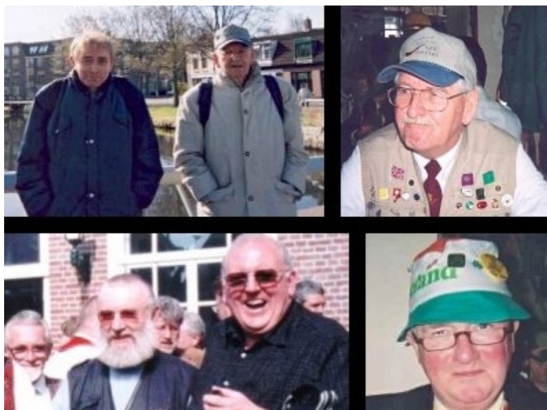
Montage of trips to Den Helder (2003) and Oirschot (2004)