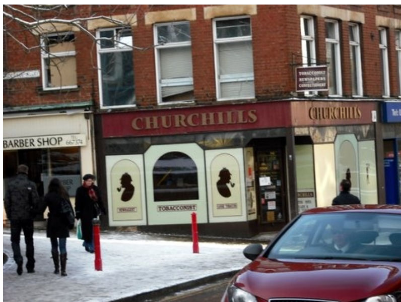
Churchills of 32 St. Andrews Street

Churchills of 32 St. Andrews Street, the last specialist tobacconist shop in Norwich, closed its doors on 30th January 2010.