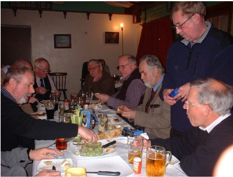
An excellent cheese board